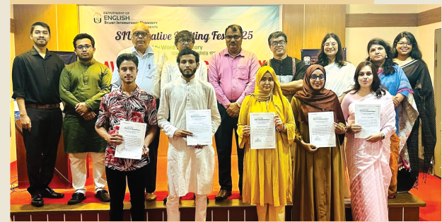
Winners of Creative Writing Fest with the guests

In celebration of International Mother Language Day 2025, the department hosted a Creative Writing Competition titled My Words, My Story . Open to participants from diverse sectors and age groups, the event received an enthusiastic response, with a remarkable collection of prose and poetry submitted. The competition became a lively platform for voices from both within the university and the wider community, reflecting the rich tapestry of creative expression and a shared passion for storytelling.