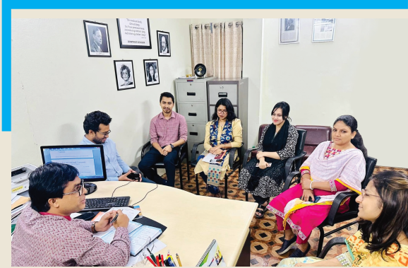
Teachers Meeting at the office of the Head of the department

The Department of English consistently organizes Teacher-Student Meetings as part of its commitment to academic excellence and inclusive dialogue. These meetings provide a structured platform where faculty members and students engage in meaningful discussions on academic matters, address concerns, and collaboratively devise strategies for the department's development. Students are encouraged to articulate their expectations and contribute constructive feedback, fostering a cooperative environment that supports continuous improvement and mutual understanding.