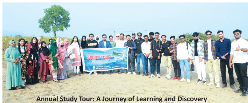
Annual Study Tour: A Journey of Learning and Discovery